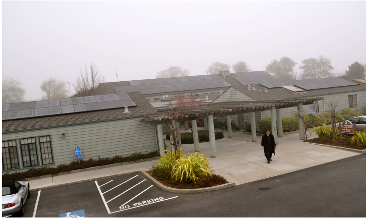
St. Ambrose Episcopal Church, Foster City

Four of over 40 solar-powered member congregations