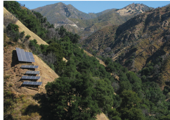
Tassajara Zen Center, Carmel Valley