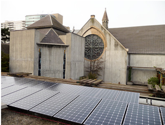
Grace Cathedral, San Francisco