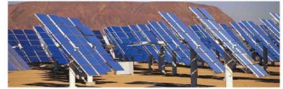
AB 32 and You: How California's Global Warming Solutions Act Delivers Smart Solutions to Californians