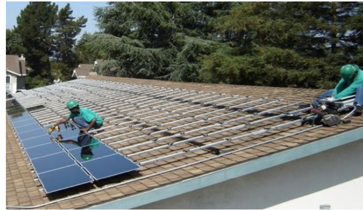
Campbell United Church of Christ