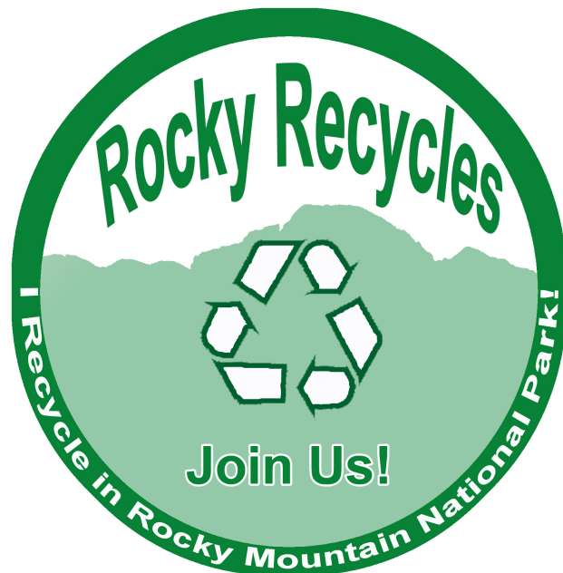
Recycling Bag Logo